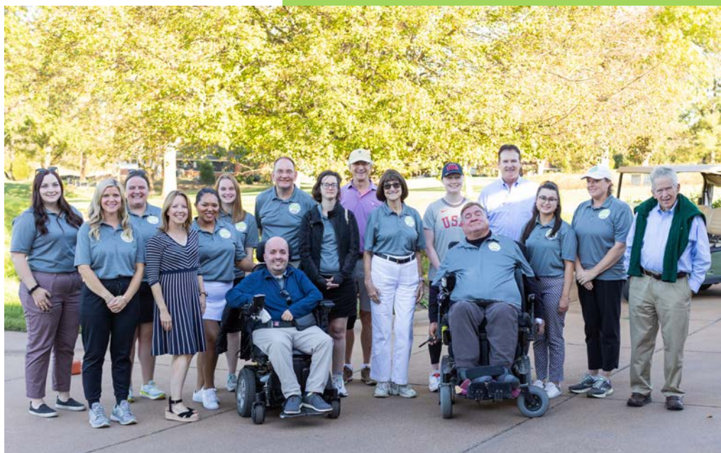
SDI Irons for Inclusion Golf Tournament with Honorary Athlete Paralympian Colleen Young